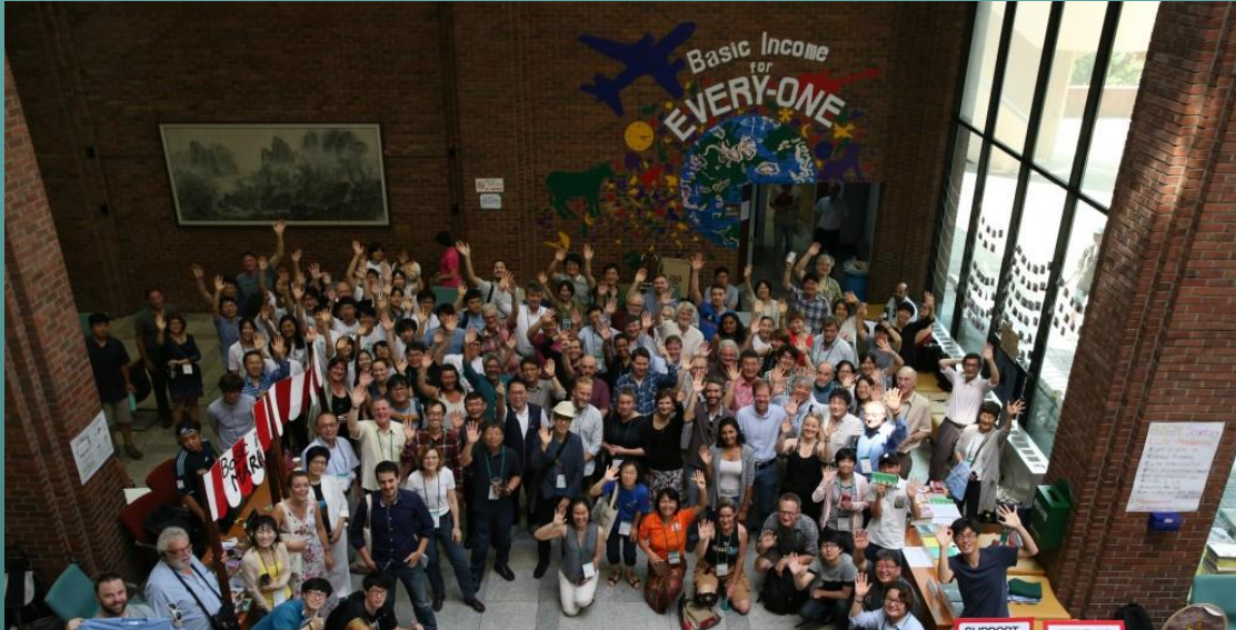
The 16th BIEN Congress hosted by BIKN on July 2016, Seoul