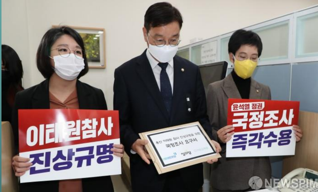
Yong Hye—In, Congress member of BIP requiring parliamentary Investigation on Itaewon disaster