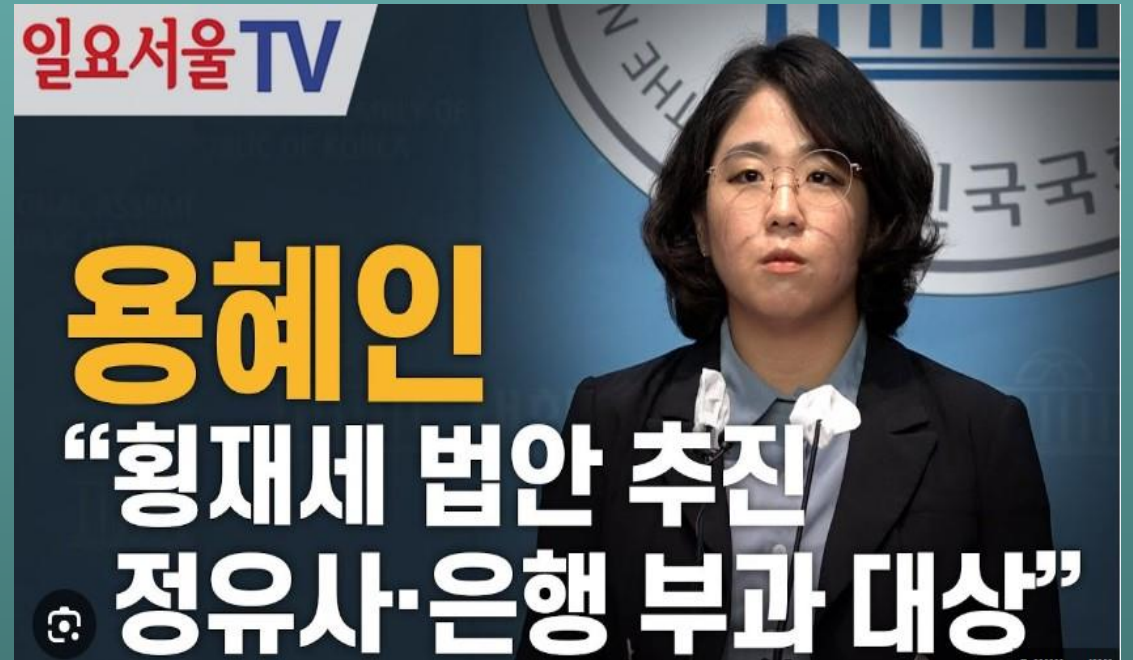
Yong Hye—In, Congress member of BIP proposing windfall bill to retrieve excess profits from oil refiners and banks