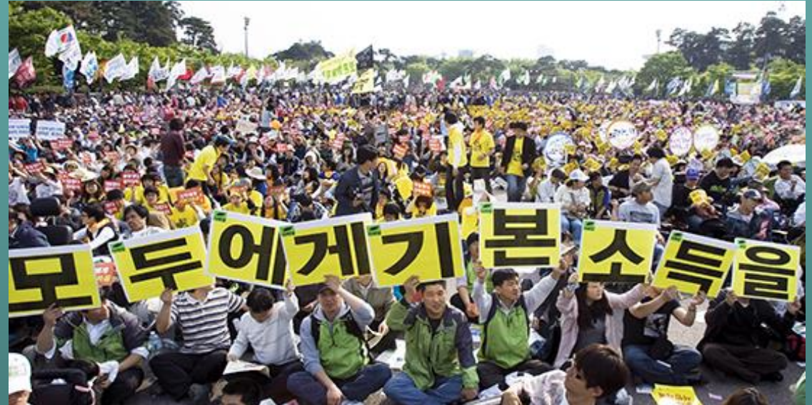
Socialist Party members requiring basic income, Mayday 2009