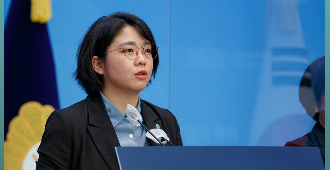
Yong Hye-In, the executive representative of BI Party, succeeded to enter the National Assembly in 2020