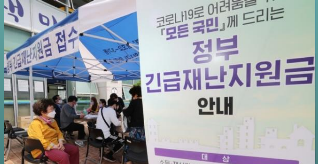
In May 2020, the government decided to pay 'Universal Stimulus Check' as a countermeasure against COVID-19