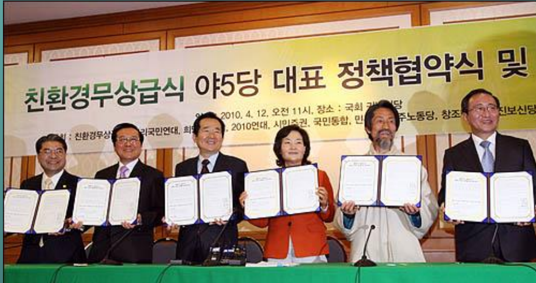
Opposition parties agreed on a joint pledge of 'free school meals' ahead of the local elections in the June 2010