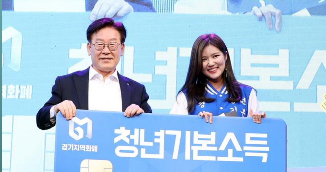
Gyeonggi-do(Governor, Lee Jae-Myung) started to give 'Youth BI' to 24 year-olds In 2019