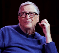
Bill Gates, the founder of Microsoft

"AI will change the labor market, ..., UBI could offset the shock."