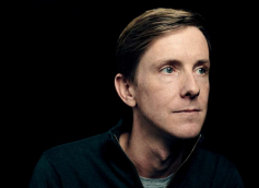
Chris Hughes, the co-founder of Facebook

"If robots are replacing people's jobs, they should pay taxes, and the taxes they pay could be used to fund social welfare."