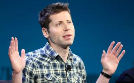
Sam Altman, the founder of Open AI

"Data are the new oil then we may have found a 21st-century revenue stream"