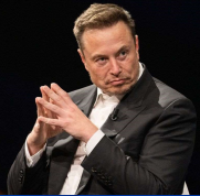
Elon Musk, the founder of Tesla

"There is a pretty good chance we end up with a UBI, ..., due to automation"